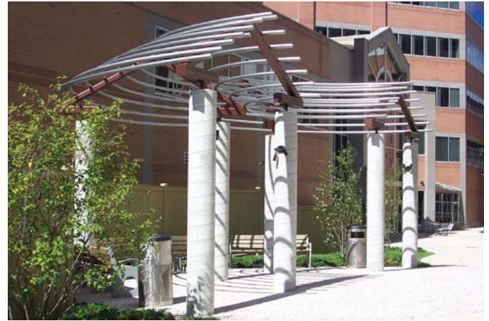
COURTYARD AT TEN FAXON

Urban courtyards provide a respite from the bustling pace of the city. Courtyards are typically enclosed spaces with limited access and intended as meeting places and for passive activities such as seating and dining. The landscape of courtyards should provide a tranquil setting that is especially suited for such activities. Trees, shrubs and perennials help define the space and provide scale, shade, color and variety.